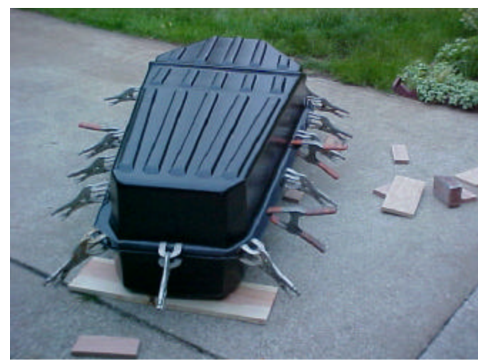
Your blind is now assembled. We would recommend sanding any rough areas to make clean edges. You can now wash it down with some denatured alcohol and scuff it up and paint it with any type of paint you would like. Enjoy.